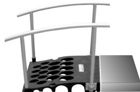
Half Bridge available with optional holes for securing bridge to ground.