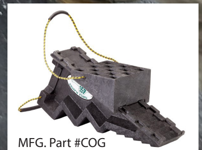
MFG. Part #COG

TURTLE PLASTICS 7400 Industrial Parkway | Lorain, OH 44053 PH: 800-756-6635 | Fax: 800-437-1603 www.turtleplastics.com | orders@turtleplastics.com